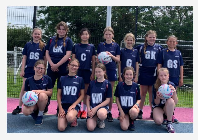
The Y6 girls have travelled down to Southend to be part of the ISA Netball tournament.

With very limited practice we had some nervous but excited netballers. Our first match was the well drilled Ursuline. We unfortunately took a heavy loss in this game but the girls really developed some lovely play ready for our next match.