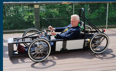
Green Power Racing