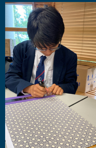
Japanese Book Binding