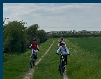
Mountain Bike Club