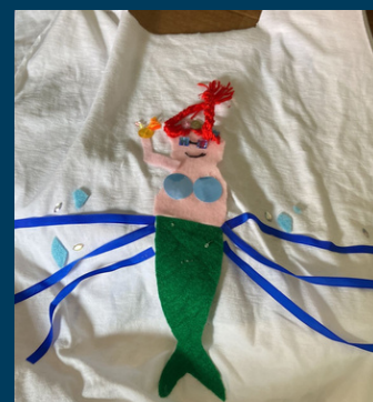
Eco Bag Project